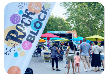
Supporting quality of life and community pride.