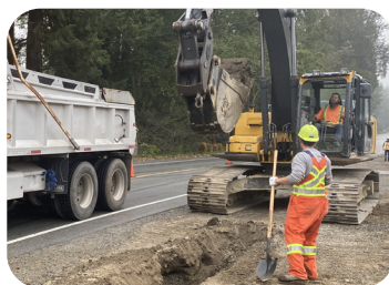
Investing in utilities and other core infrastructure.