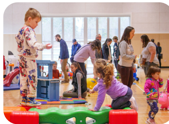
Expanding recreation programs and spaces for swimming, fitness, and more.