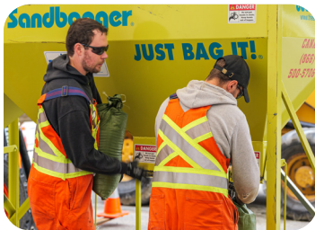
Keeping our community safe and resilient to emergencies.

The City's 2026 operating and capital expenditures total $551 million and prioritize what we heard from residents in our 2025 Community Survey. Learn more at MapleRidge.ca/Budget2026 .