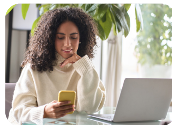
Supporting businesses and development by streamlining and modernizing processes.