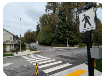
Installing active transportation amenities to support walking and cycling.