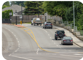
Prioritizing road projects to reduce traffic congestion.