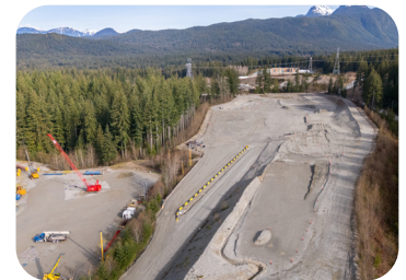
Opening up industrial land and attracting business to balance tax sources.