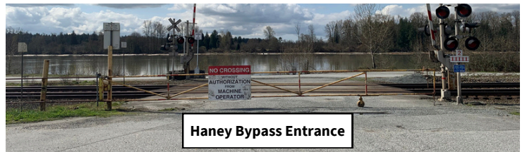
Haney Bypass Entrance