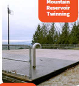
Grant Mountain Reservoir Twinning