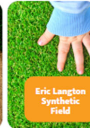
Eric Langton Synthetic Field