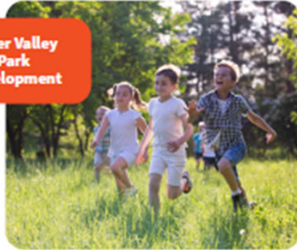
Silver Valley Park Development