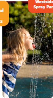
Westside Spray Park