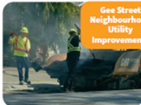
Gee Street Neighbourhood Utility Improvements