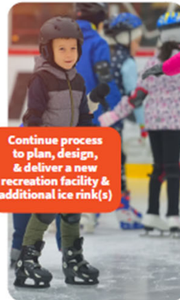
Continue process to plan, design, & deliver a new recreation facility & additional ice rink(s)