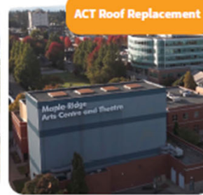
ACT Roof Replacement