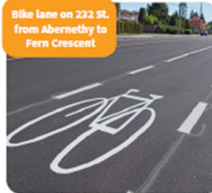
Bike lane on 232 St. from Abernethy to Fern Crescent