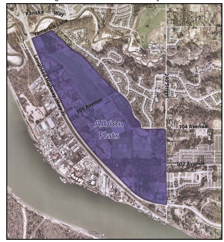
Figure 1.1 – Albion Flats Study Area

The Albion Flats area in the District of Maple Ridge has been identified as a strategic area for intensified land use development. In February 2010, the District's Council approved the process for preparing the Albion Flats Concept Plan for submission to the Agricultural Land Commission. The concept plan will include a review of various land use concepts and the required infrastructure to support these land uses. The geographic boundaries of the study area are shown in Figure 1.1.