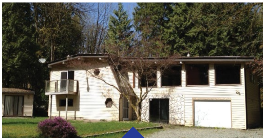
House & Front Yard

Fern Crescent - 23740 Fern Crescent, Maple Ridge, BC