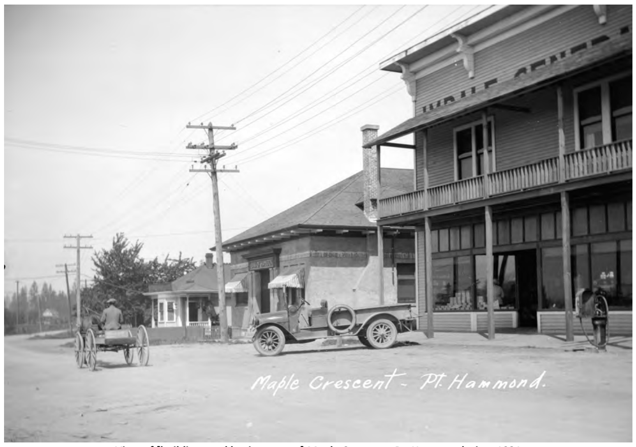
View of [buildings and businesses on] Maple Crescent - Pt. Hammond, circa 1921.

In general, heritage conservation initiatives provide community placemaking opportunities, support stability in the marketplace and help protect property values.