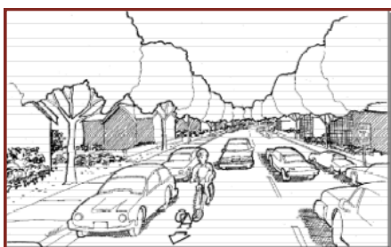
Marked Wide Curb Lanes

7 - 33 Maple Ridge will make road safety a priority in the planning, operation and maintenance of the road network for cycling in the District.