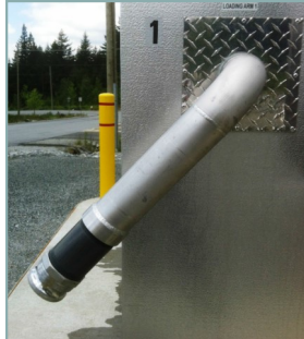
*75 mm (3 inch) male cam-lock fitting from filling station to female