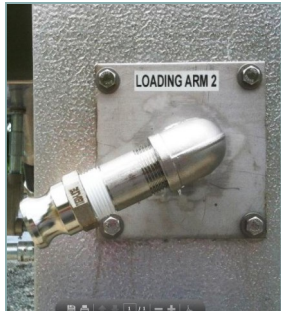
*25 mm (1 inch) male cam-lock fitting from filling station to female