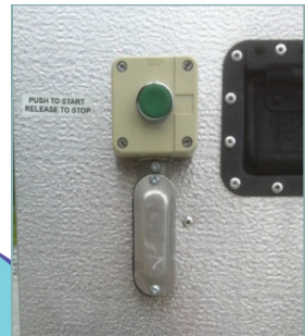
Push Button (No OPERATOR ID or PIN NUMBER required)