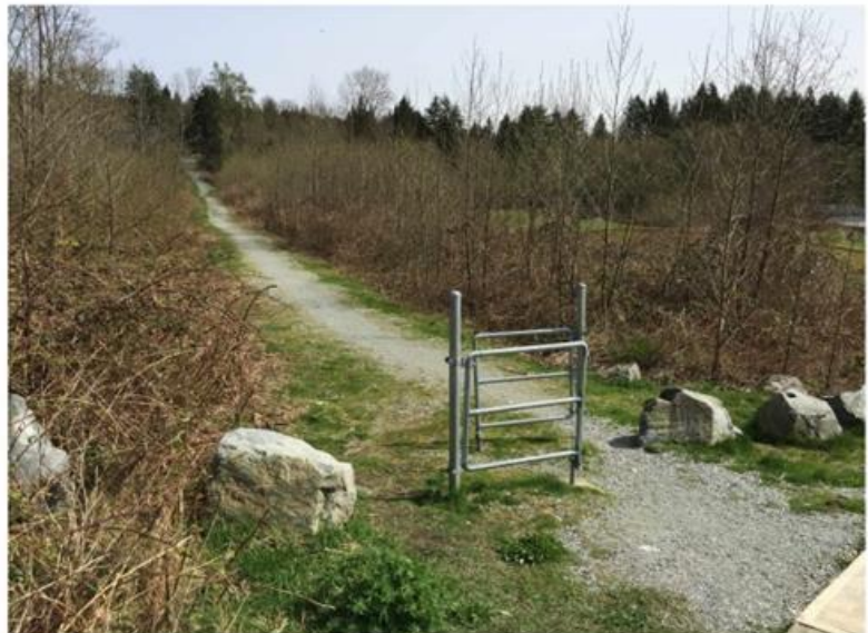
Looking east along the existing trail