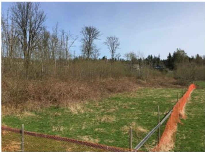
View to north east