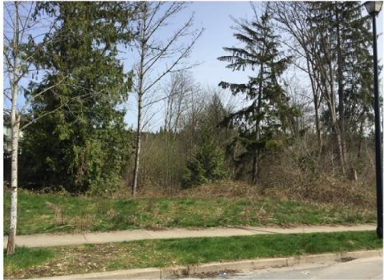
View to east from 230 A St.