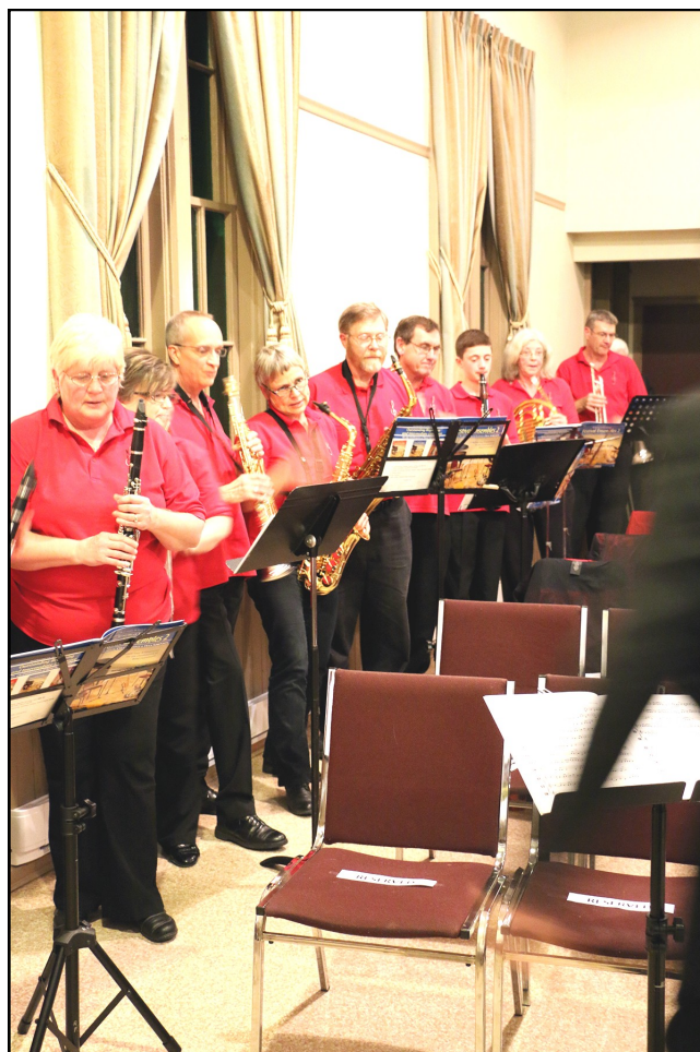
Maple Ridge Concert Band