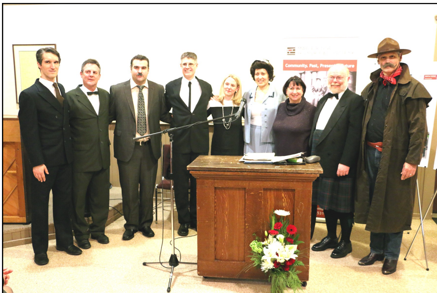
Emerald Pig Theatrical Society with Mayor Nicole Read