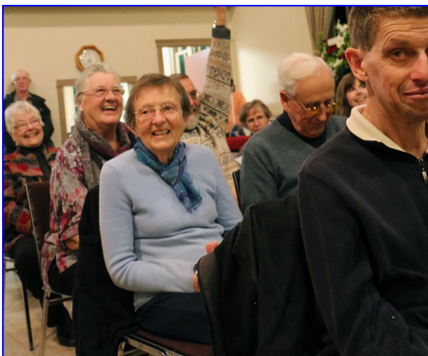
Old friends and new in the audience