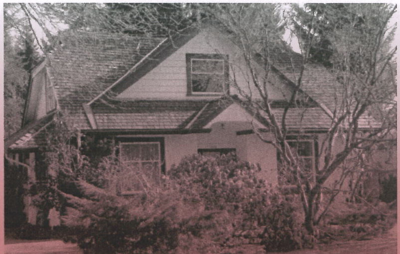
The "Buckerfield House," Heritage Building Award, 2009.