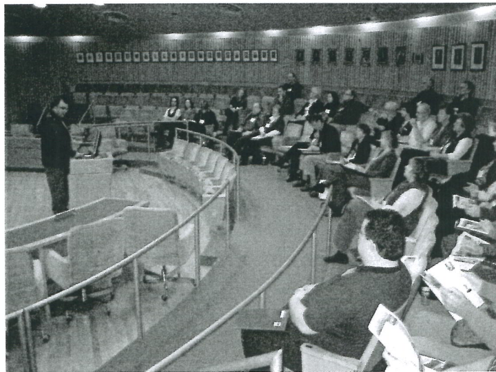
Mayor Ernie Daykin addressing CHC Networking Conference on 28 November 2009.