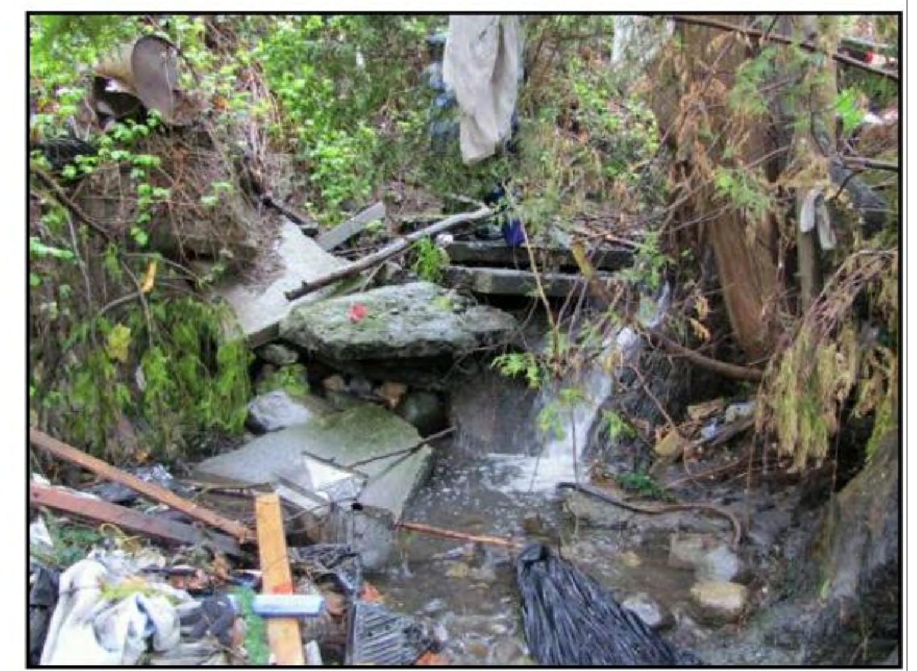
Plate 8: North. Substantial anthropogenic impacts in the ravine.