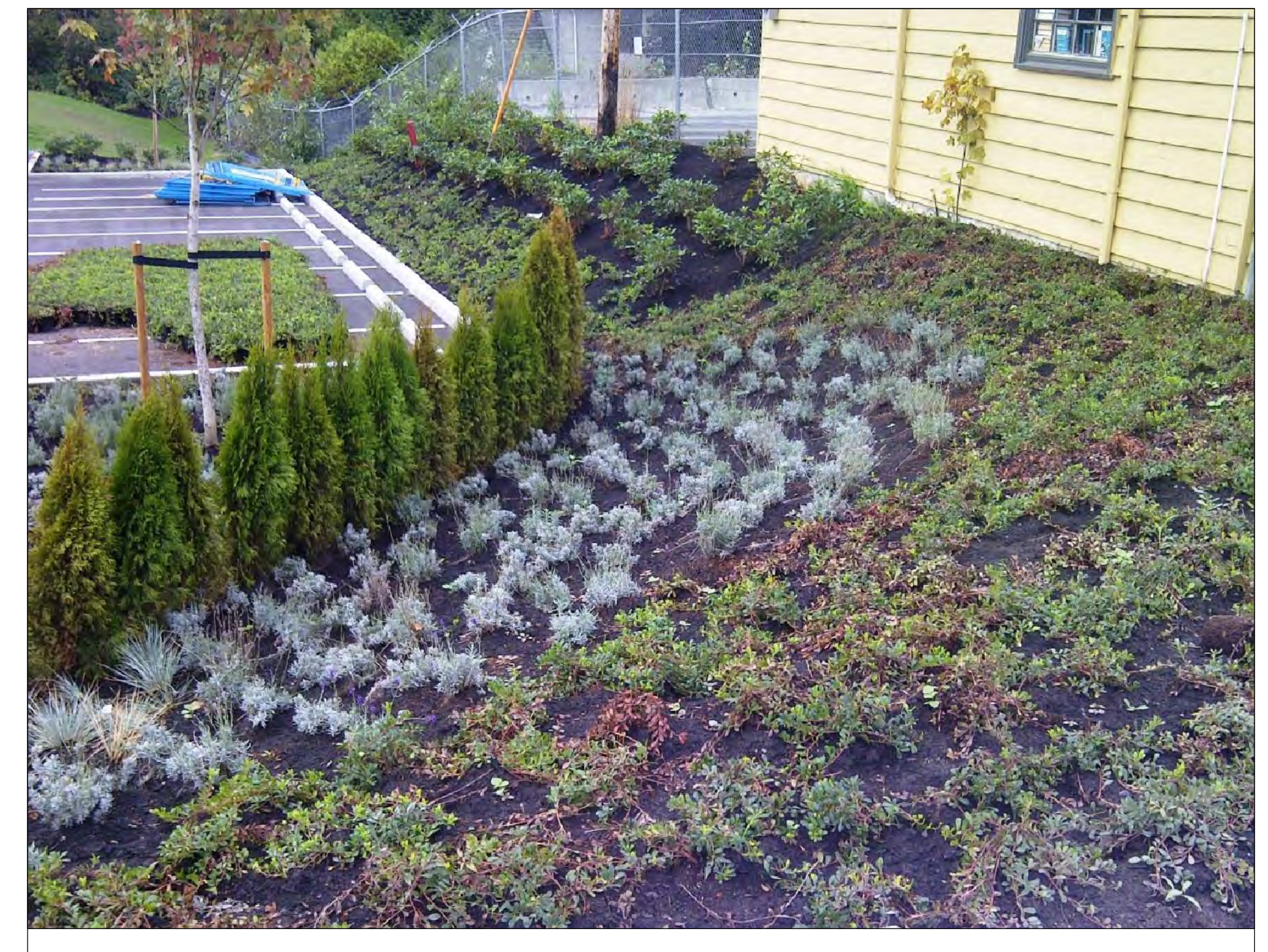
Slope restoration efforts