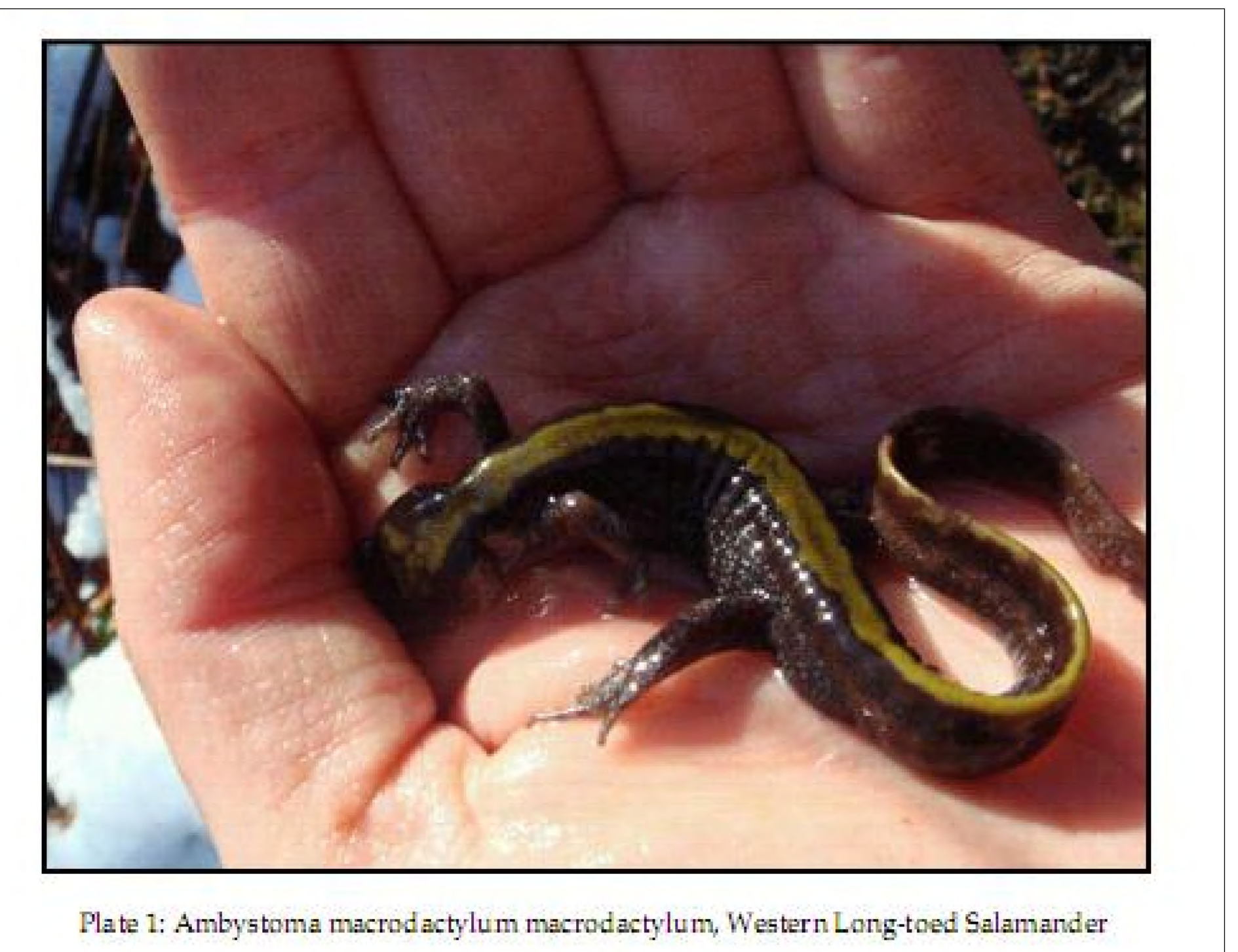
Plate 1: Ambystoma macrodactylum macrodactylum, Western Long-toed Salamander