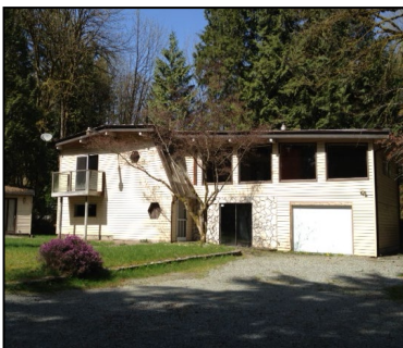
House & Front Yard

SPECIFICATIONS: Located at 23740 Fern Crescent , this is an older, unfurnished home (30+ years old, approx. 2,500 sf) with basic finishing including four bedrooms, living room, family/rec room, three washrooms, laundry room, storage room and garage that could be used for workshop, production and rehearsals etc. Driveway for 2-3 vehicles. The house is built next to a park trail and river which are well used in the summer. Note that part of the lawn area will be a shared space for overflow parking for the Lapidary Club and Artist in Residence guests and participants. Occupancy is limited to four to six persons (including children). As this is a large house, artist collectives/teams applying may be considered differently.