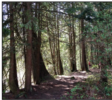
Trail from Maple Ridge Park runs along front yard following river