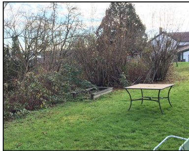
Back Yard – River in the distance