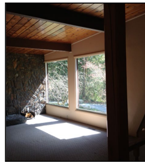
Living Room & Rec/Family room on upper floor.